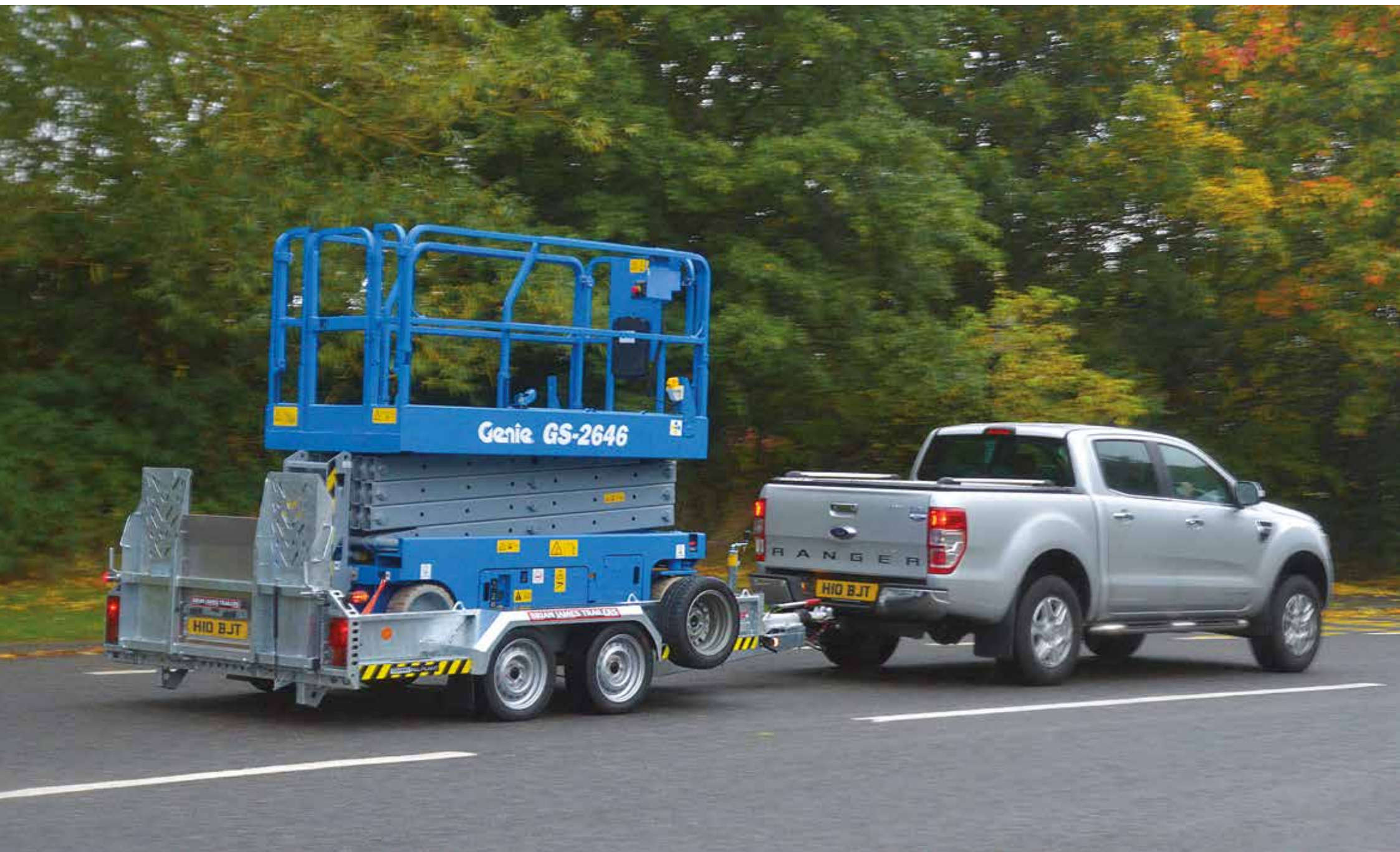
CARGO ALL PLANT TILTBED.