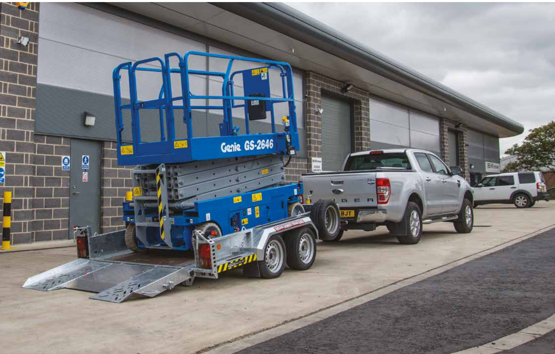
CARGO ALL PLANT TILTBED.