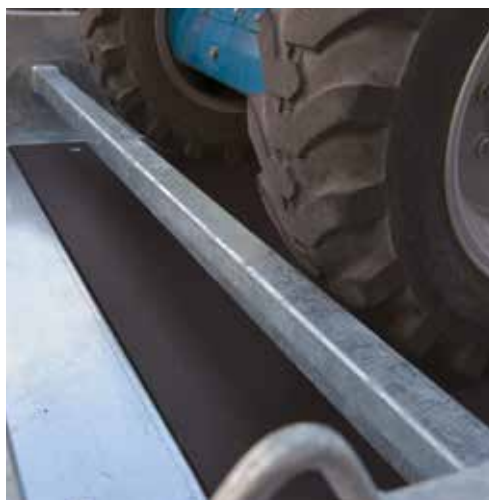
● Machine stop bar Set up to provide consistent load positioning.