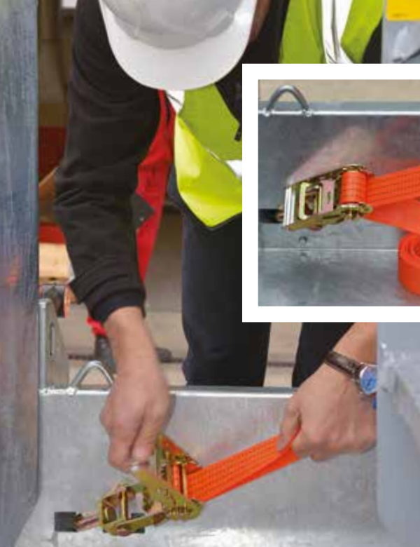
● Tie-down straps heavy duty, set of 4 for easy and secure fastening of machinery.