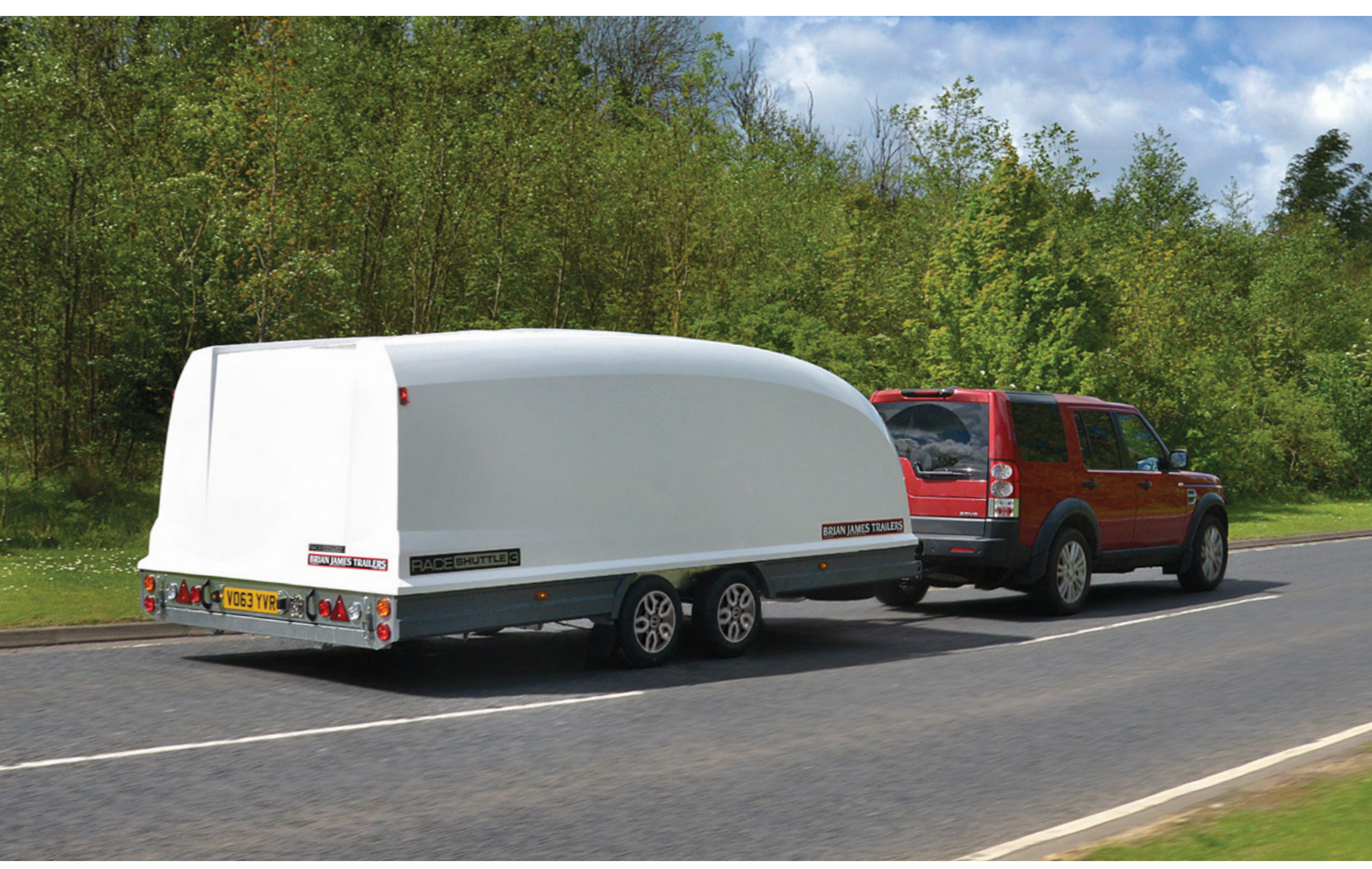
RACE SHUTTLE 3