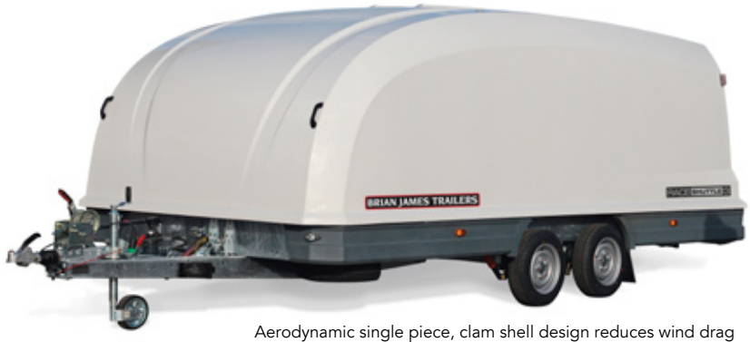
and improves towing fuel consumption.