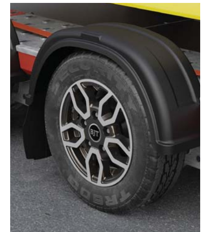
○ Alloy wheels A Transporters are also available with alloy wheels in standard Silver or diamond-cut Anthracite (Anthracite shown).

Internal size: 425mm length, 90mm depth, width dependent on chassis load bed width.