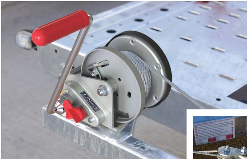
○ Manual winch, load pressure auto braked, + 6 point adjustable pull positions.