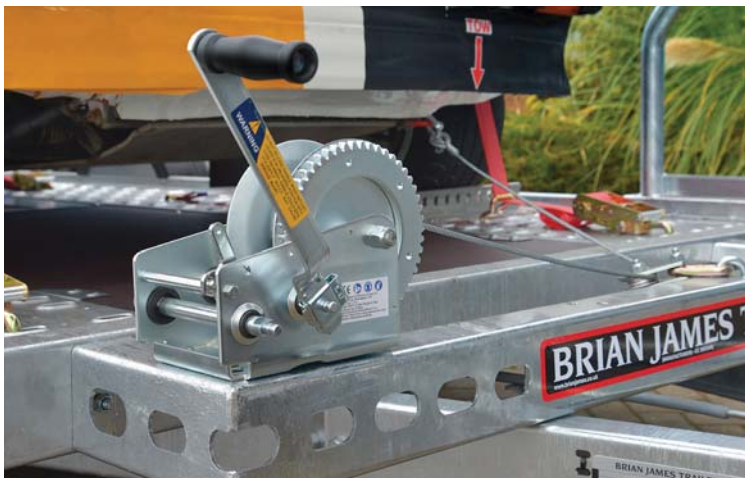
○ Manual winch + 3 point adjustable pull positions.