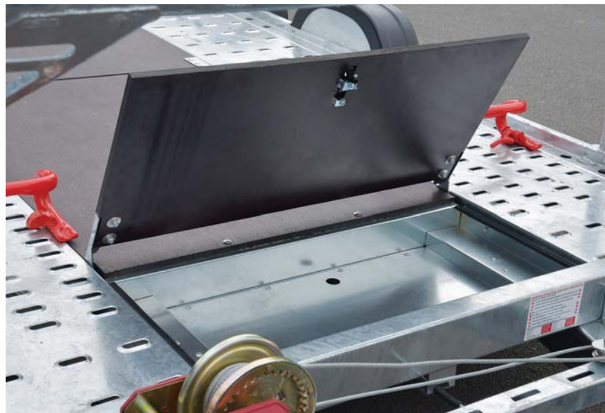
● Storage bed locker (front) Lockable front storage locker, with automatic lift lid.

Internal size: 425mm length, 90mm depth, width dependent on chassis load bed width.